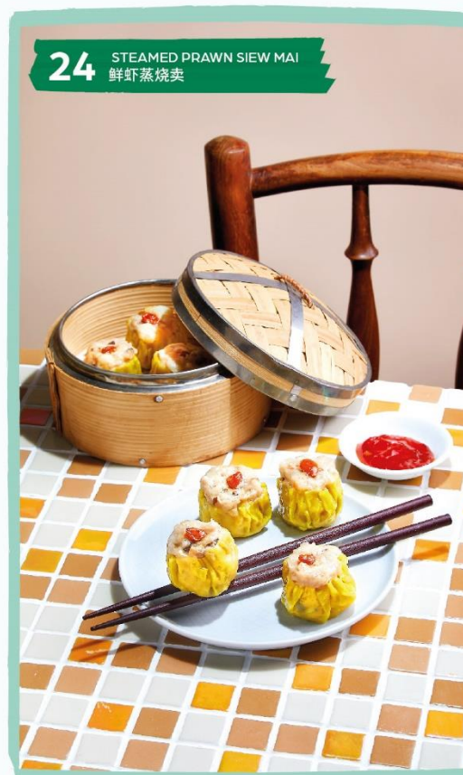
24 STEAMED PRAWN SIEW MAI 鲜虾蒸烧卖